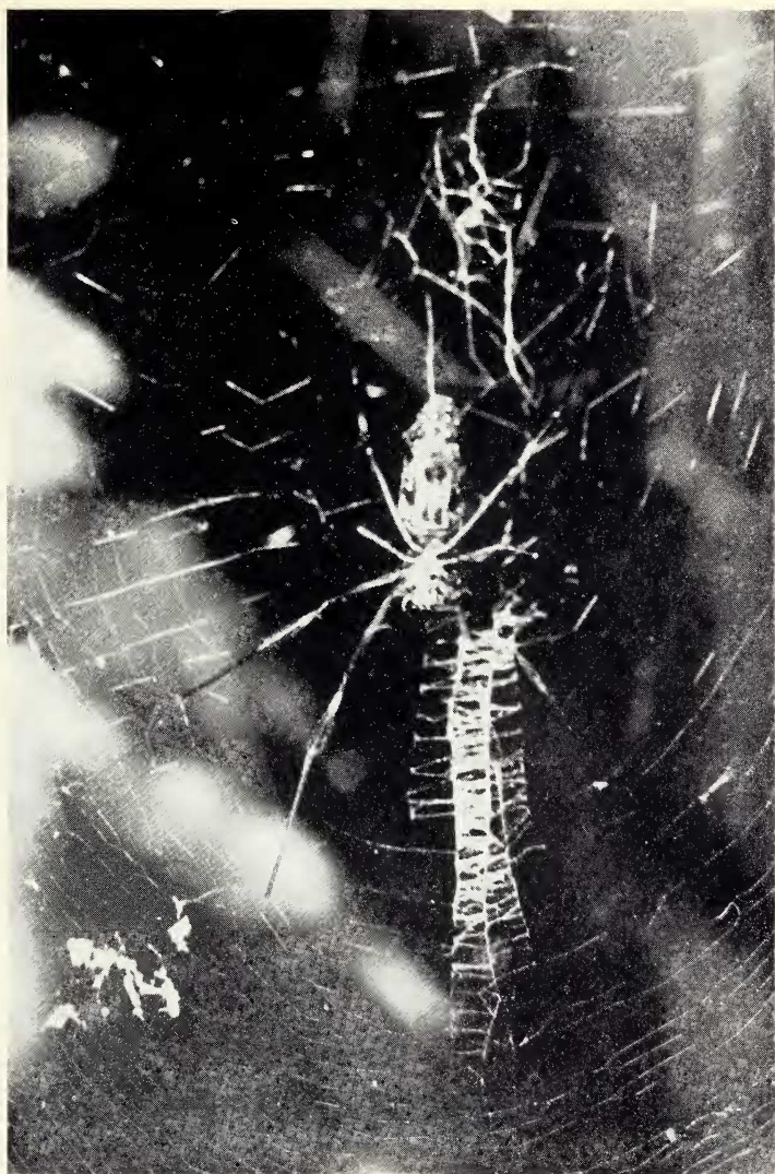
Fig. 1. Stabilimentum in perfect web of juvenile female Nephila clavipes . Dimensions in text.